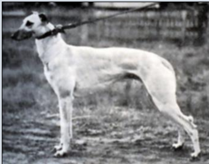
The Great Silver Chief after winning 1939 Waterloo Cup

The Feikuai Greyhounds Silver Chief Classic is certainly one out of the box and is sure to produce yet another champion who will go on to great heights; as have previous winners.